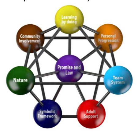
The Scout Method

Community involvement: Major mission of both the Scout Method and the LLC, the effect on the community involvement could be increased by this collaboration. Some Lesson Plans directly involve the community and the dissemination part of the YRE methodology addresses to the community. LLC activities are a great way to invite the community to participate and vehiculate positive environmental attitude. Our impact assessment shows a significant increase of active citizenship in LLC participants.